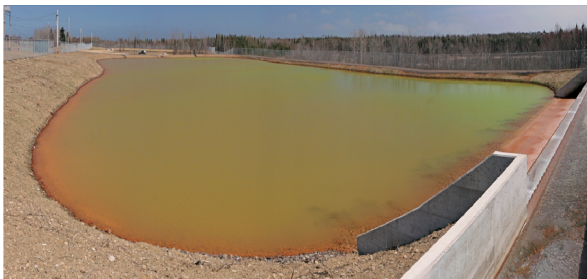
Figure 1 View of the Neville Street settling pond with the mine water inflow and cascade on the right and the outflow in the upper left corner. Length of the settling pond 150 m, width 60 m